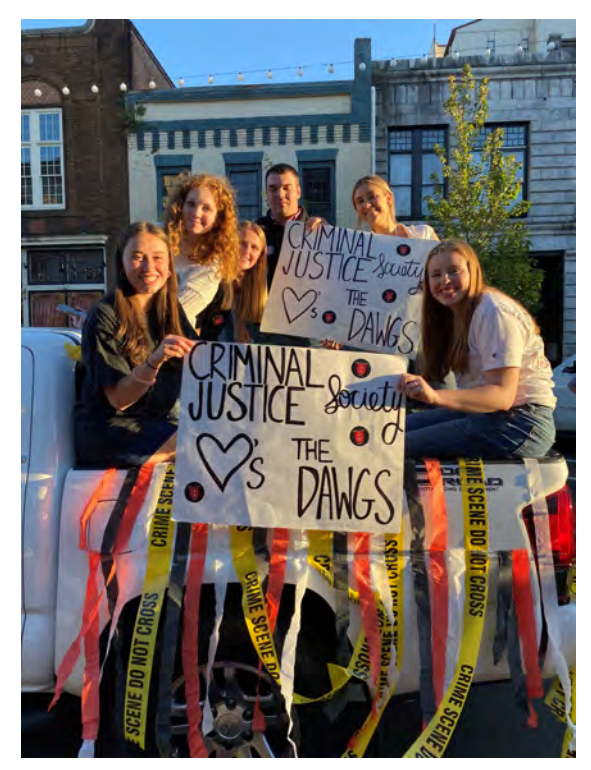
UGA Homecoming Parade